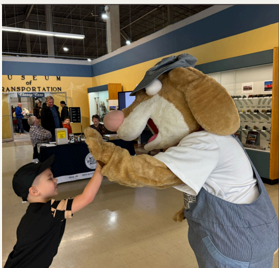
2025 Thunder Creek Model Train Show in Moose Jaw, SK on March 22nd & 23rd.

67% OF INCIDENTS HAVE INVOLVED PROFESSIONAL DRIVERS.